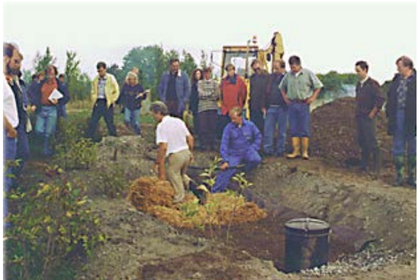
ROTZONEN I PEGASUS TRÄDGÅRD I HÖG